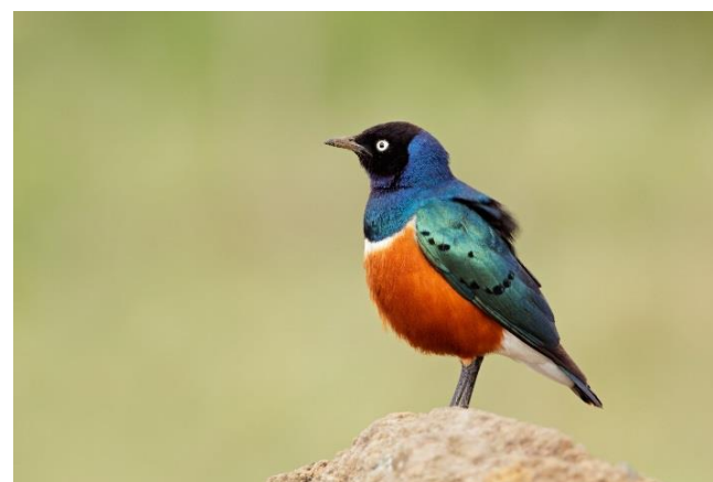
From top: Lion, African Elephants & Superb Starling.